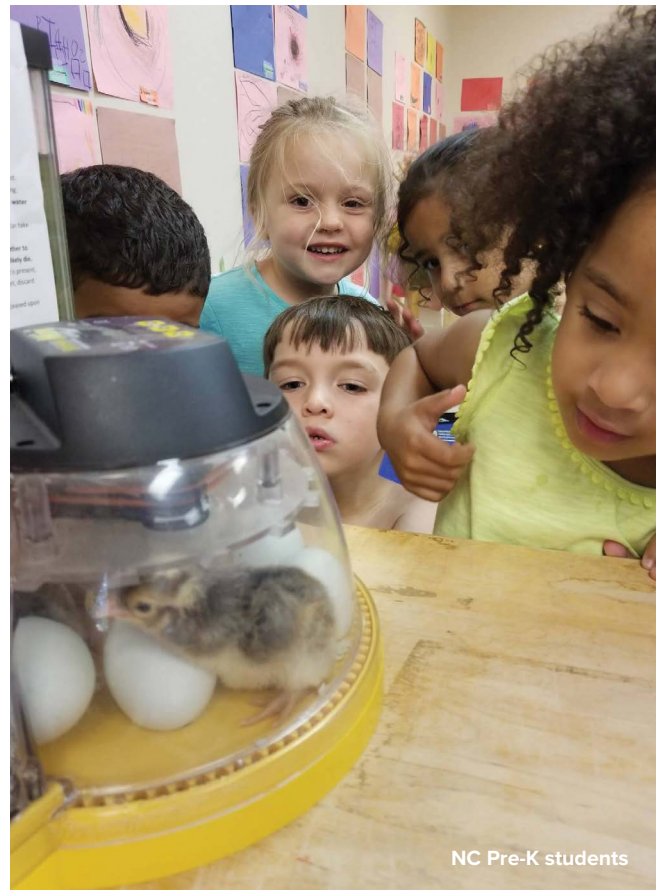
NC Pre-K students

95% of NC Pre-K graduates meet “ready for school” measures