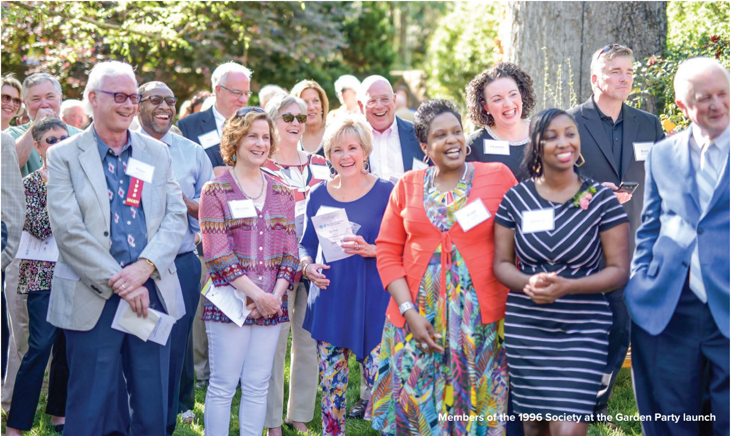
Members of the 1996 Society at the Garden Party launch

Wake County Government Wake Technical Community College Whisk Winwood Hospitality