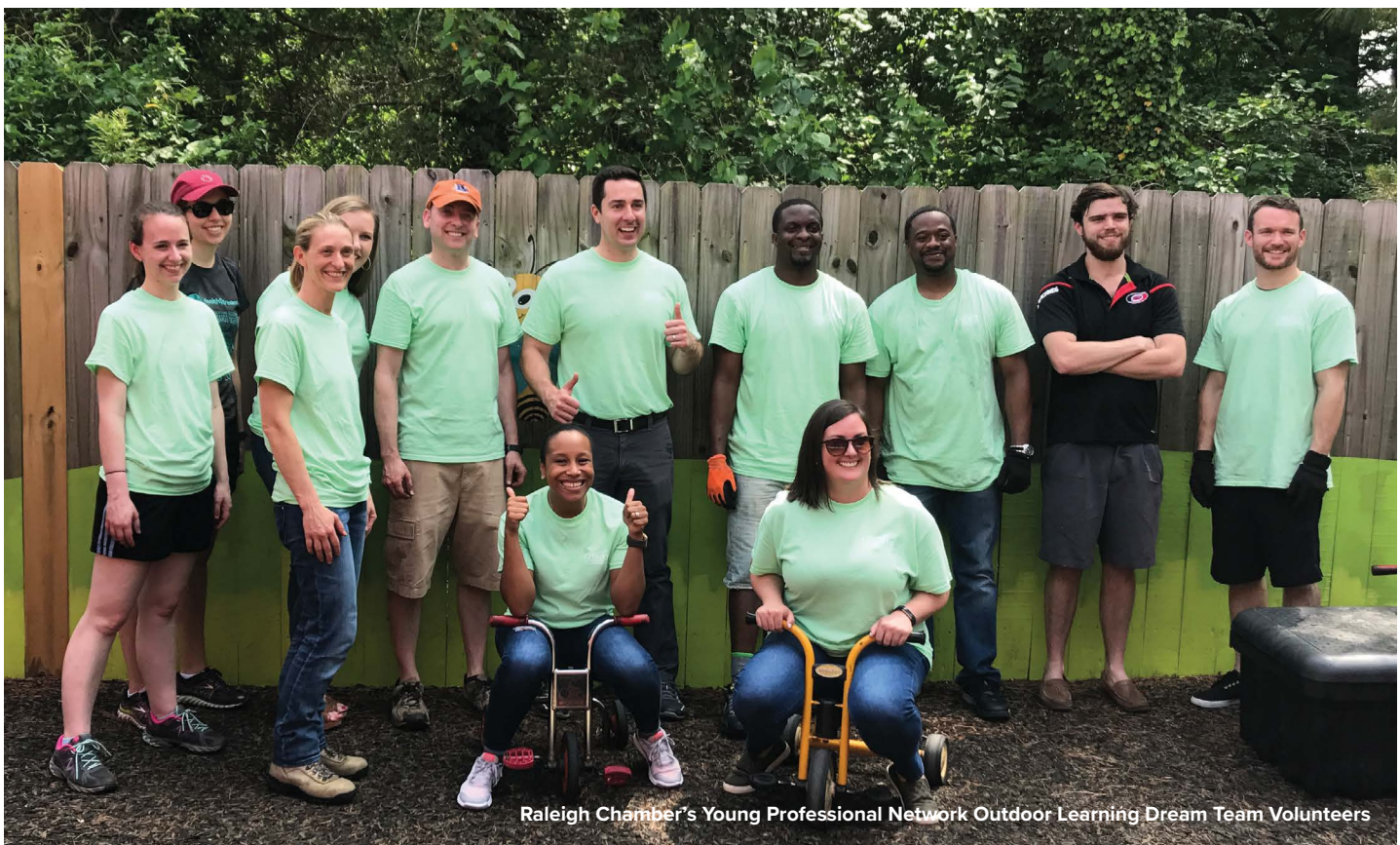
Raleigh Chamber's Young Professional Network Outdoor Learning Dream Team Volunteers